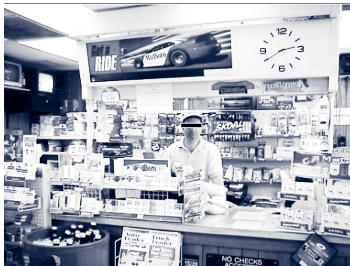
FIGURE. Convenience store offering single bottles of beer chilled in bucket for sale near checkout location — North Carolina, 1999