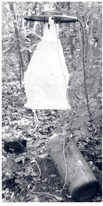
FIGURE. CDC light trap used during investigation to capture Anopheles sp. mosquitoes