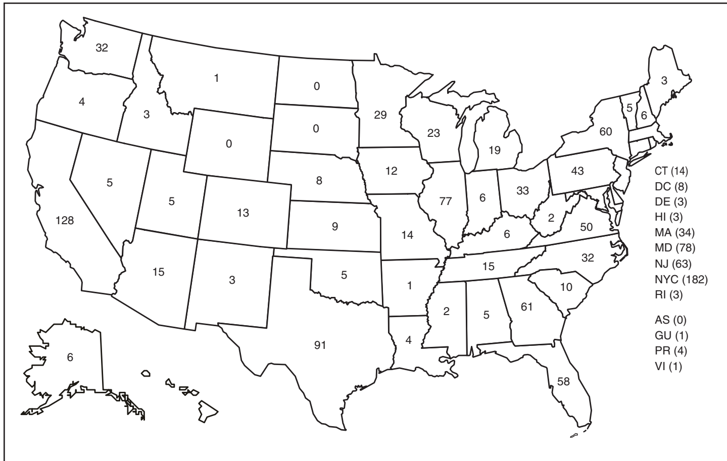
FIGURE 1. Number of malaria cases (N = 1,298), by state or territory in which case was diagnosed — United States, 2008

Abbreviations: AS = American Samoa; GU = Guam; PR = Puerto Rico; VI = U.S. Virgin Islands.