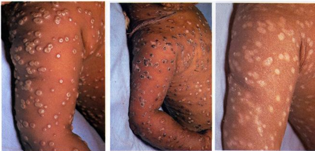
FIGURE 2. Progression of smallpox lesions from, left to right, pustules to scabs to scars