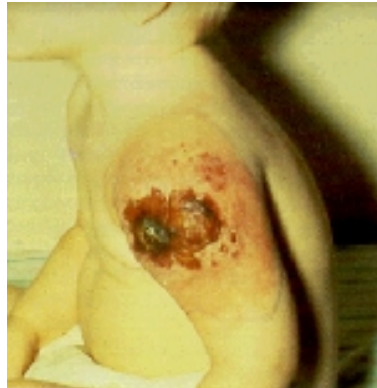
FIGURE 8. Progressive vaccinia (vaccinia necrosum), which was fatal, in a child with an immunodeficiency