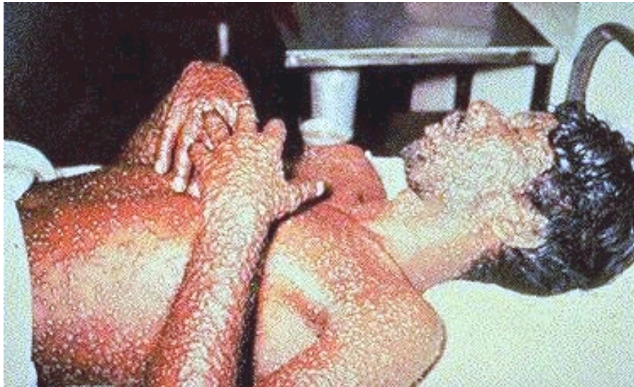
FIGURE 1. Man with smallpox