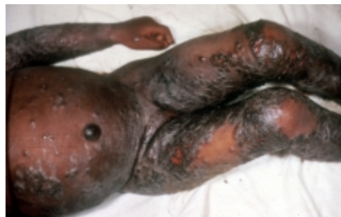
FIGURE 5. Eczema vaccinatum

Eczema vaccinatum is a localized or systemic dissemination of vaccinia virus among persons who have eczema or a history of eczema or other chronic or exfoliative skin conditions (e.g., atopic dermatitis) (Figure 5). Usually, illness is mild and self-limited but can be severe or fatal. The most serious cases among vaccine recipients occur among