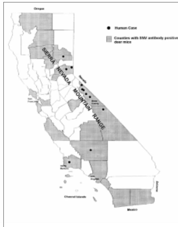
Figure 1. Geographic distribution of hantavirus pulmonary syndrome cases and occurrence of Sin Nombre virus antibodies among deer mice ( Peromyscus maniculatus ), California, 1975–1995 (n=1,921).

Antibody prevalence among deer mice increased significantly ( p < 0.001 ) with rising altitude (Figure 2). In the regression model, adjusted odds ratios steadily increased with elevation, peaking at 4.3 in the 1,800- to 2,100-meter range (95% confidence intervals = 1.3, 16.7) (Table 4). The increased prevalence of SNV antibodies in deer mice trapped at higher elevations correlated with an increased incidence of HPS cases at elevations above 1,200 meters (Table 3).