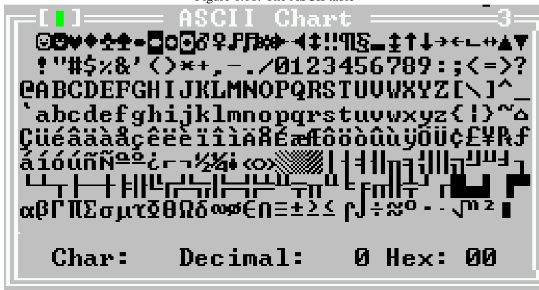
Figure 6.18: The ASCII table

The ASCII table remains active till another window is explicitly activated; thus multiple characters can be inserted at once. The ASCII table is shown in figure (6.18).